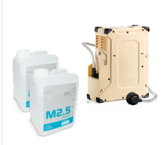
JENNY 1200 set: 7.7 kg Energy capacity: 5 kWh