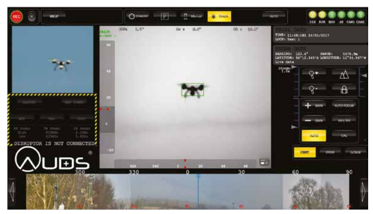
AUDS EO/RF Inhibitor GUI