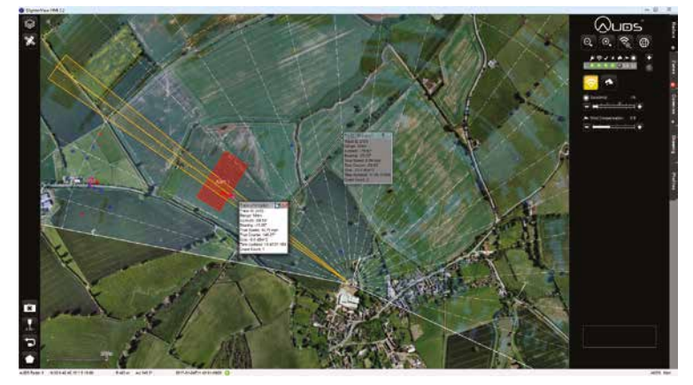
AUDS Radar GUI

One screen displays the AUDS Radar GUI (or 'HMI') which alerts the operator to drone intrusions into protected airspace. The second screen displays the AUDS EO/ RF Inhibitor GUI (or 'VMS'). The screens can be stacked vertically or sit side-by-side and are operated through a wired keyboard, mouse and optional joystick. Ruggedised laptops or third-party existing C2 consoles can also be used. AUDS uses an open architecture and can receive information from existing systems or cue other effectors. An option for mission recording can also be included.