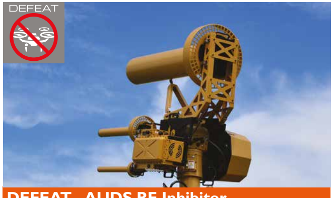
DEFEAT – AUDS RF Inhibitor

The AUDS RF Inhibitor is a purpose-designed multi-band system, engineered for maximum effectiveness against UAS command and control (C2) links. RF inhibition can be activated either selectively or simultaneously across the 400 MHz to 6 GHz spectrum, targeting five threat 'bands' which are designed to defeat the C2 links commonly deployed throughout the UAS threat landscape (i.e. 433 MHz, 915 MHz, 2.4 GHz, 5.8 GHz and GNSS bands).